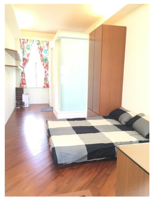
Accommodation: 8 suites, a self-serving kitchen, and a laundry space