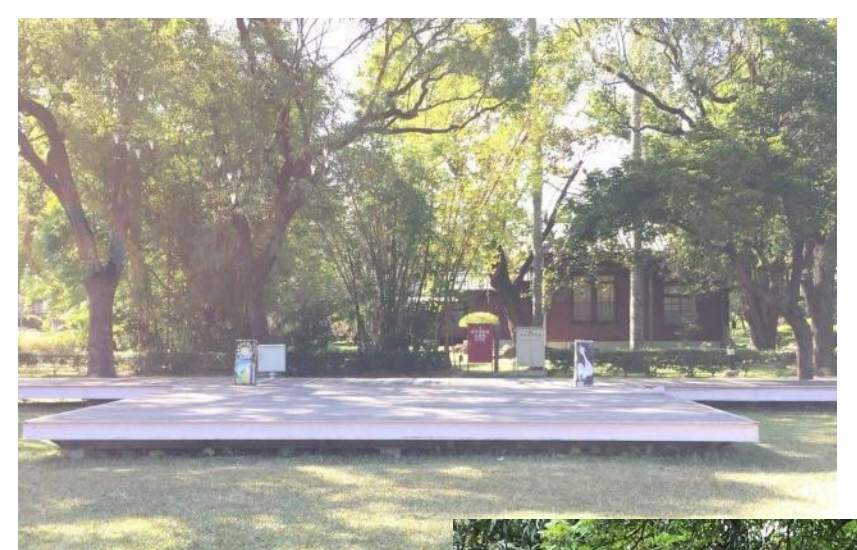
Performance Stage 1